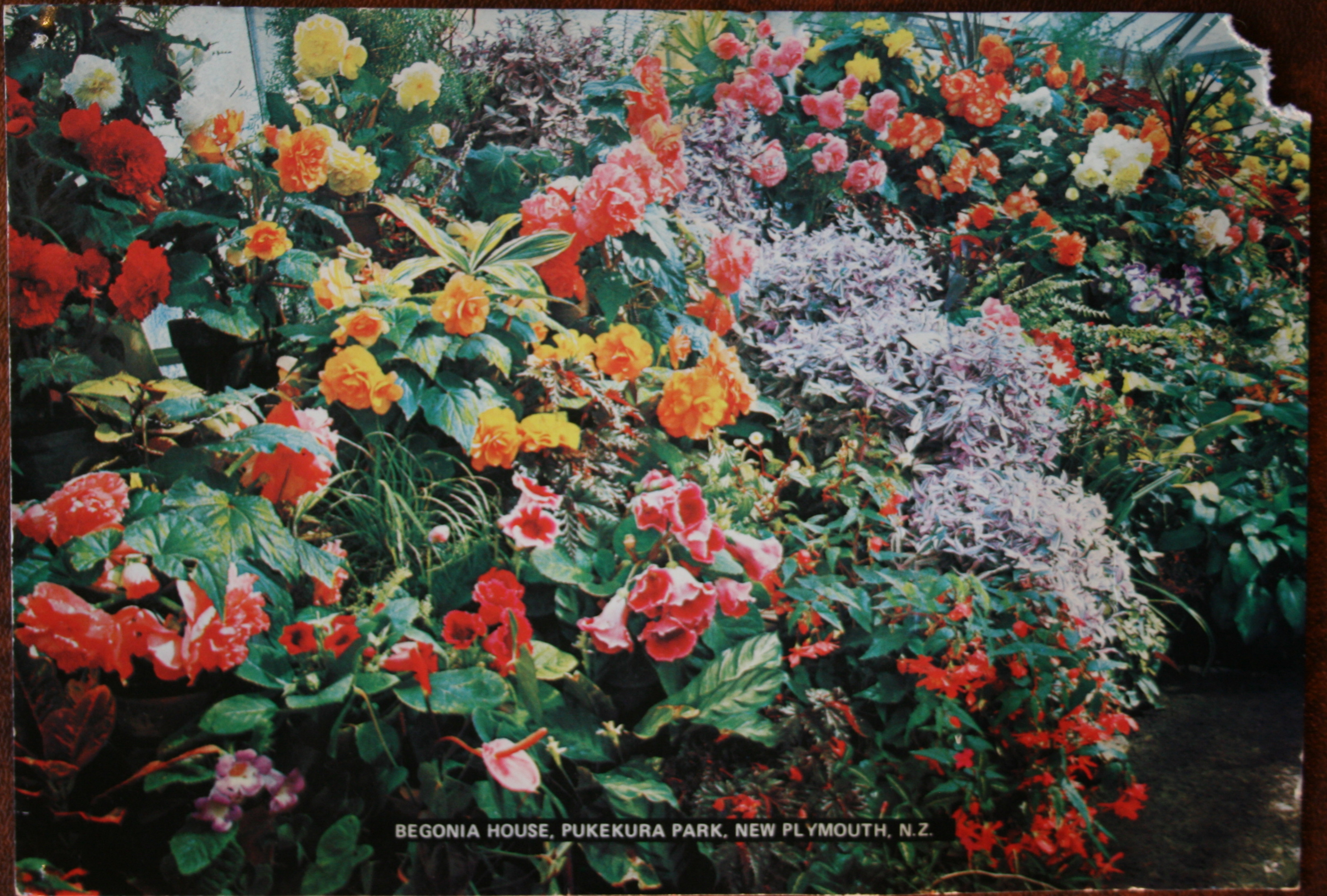
BEGONIA HOUSE, PUKEKURA PARK, NEW PLYMOUTH, N.Z.